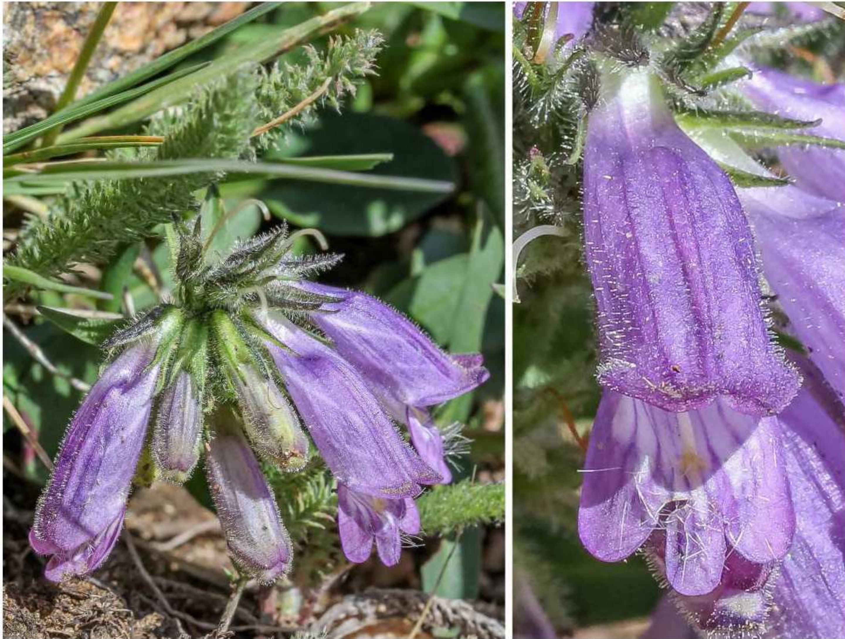
Figure 2. Flower and inflorescence of Penstemon bleaklyi .